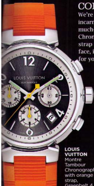
LOUIS VUITTON Montre Tambour Chronograph with orange strap, Greenbelt 4

We're loving the orange incarnation of Louis Vuitton's much-loved Montre Tambour Chronograph. With its rubber strap and citrus accents on the face, it's the perfect shot of color for your summer wardrobe.