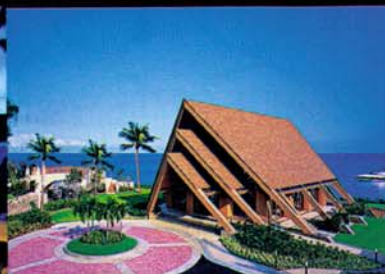
Shangri-La Mactan's breezy Ocean Pavilion (above). Homemade lamb sausage flatbread pizza baked in wood-fired brick oven at Abaca (below)